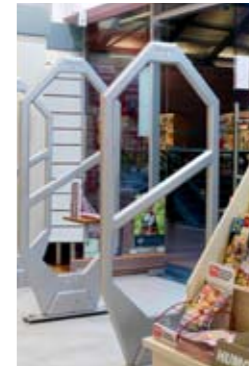
EM – Electromagnetic