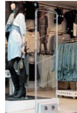
RF – Radio Frequency

Different products and stores require different article surveillance solutions. No single technology can cater for every need. Gateway is unique in developing, manufacturing and marketing all existing EAS technologies. We have complete solutions to suit any kind of store, from supermarkets and department stores to bookshops and pharmacies.