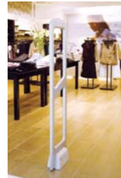
AM – Acousto-Magnetic